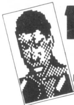
FRANK BRUNO GREAT BRITAIN