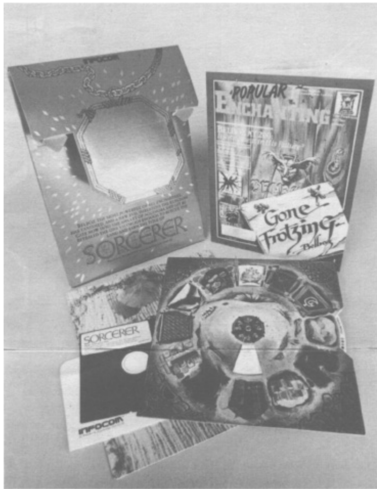
Included in the Sorcerer package you will find an issue of Popular Enchanting Magazine, the Creatures of Frobozz Infotater, and a handy storage pouch.